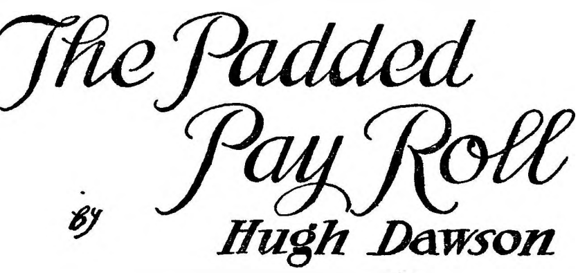
Author of ... The Midnight Terror," etc.;

WARNING! Imitation may be the sincerest form of flattery, but we feel sorry for the reader who buys an imitation. Do not be deceived; insist upon having the original DETECTIVE STORY MAGAZINE.